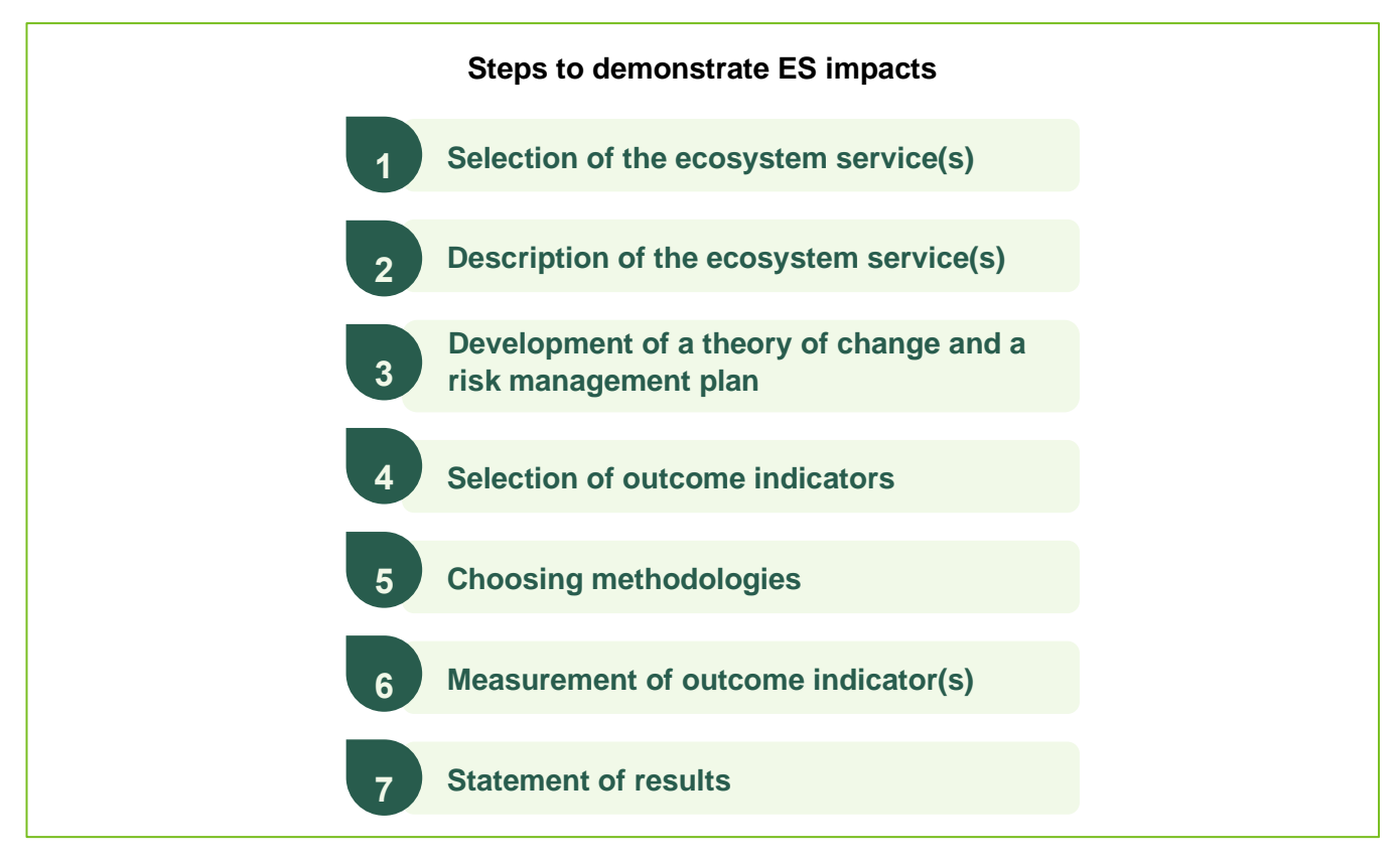
Figure 2 Steps to demonstrate an ES impact

The <<u>FSC-GUI-30-006 Guidance for Demonstrating Ecosystem Services Impacts</u>> includes tailored guidance for Organizations managing SLIMF or CF to support them in implementing this procedure. The tailored guidance follows the principle of scale, intensity and risk (SIR). Organizations managing SLIMF or CF will then have access to simplified ways to conforming with the requirements of Part II.