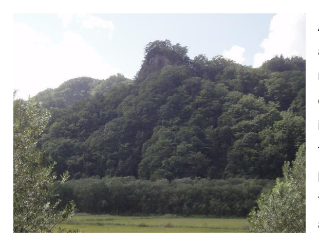
Figure 3 Muinoka, a site of Ainu folklore. The legend has it that the half-moon-shaped rock exposure was a winnowing basket that the wife of Okikurmi Kamuy (God) left behind when she was returning to heaven.

Mitsui & Co., Ltd. has large area of forest in this area, and it has been engaged with the local Ainu organization of the area. It obtained the map of lorus from Biratori Town municipal government and identified three lorus within its corporate forest to protect them as "cultural protected forests". Through collaborative field survey with the local Ainu experts, it has identified culturally important sites, including Okikurumi and Muinoka, which are nationally designated scenic spots, "Pirka Noka."