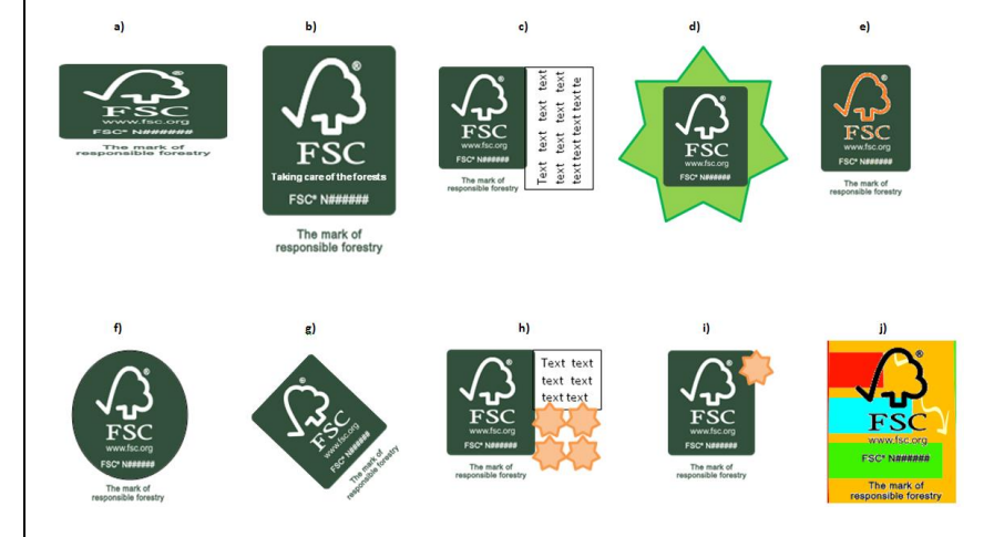
Figure 7: examples of unacceptable uses